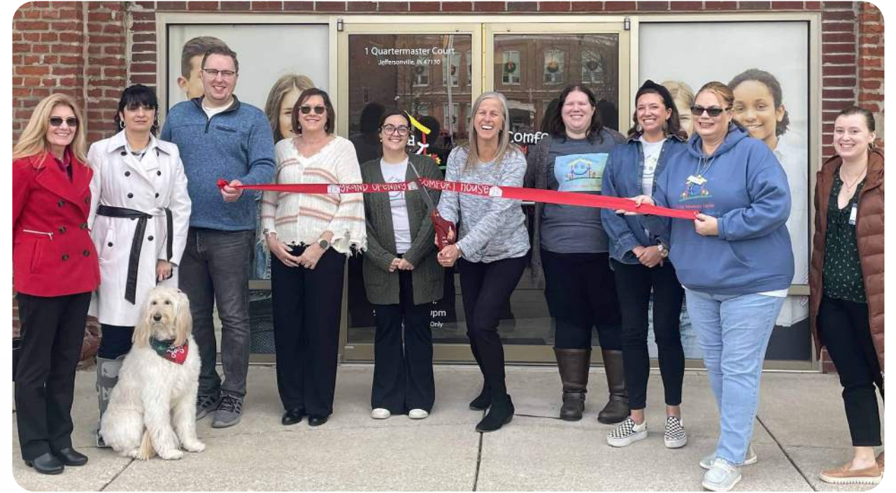
Comfort House celebrated their ribbon cutting and formal opening on December 19, 2024.